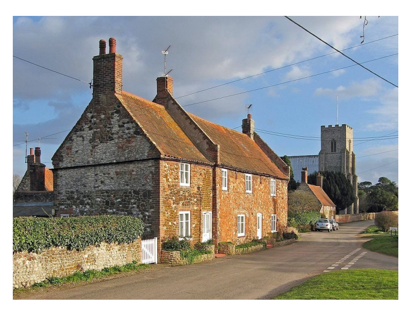
Hunstanton: Red-brick, with lime, sand and cobblestone mixed, roofed with pantiles with higher gable-ends.

On now to Hunstanton where you will find the first example of limestone or sandstone in the walls, inland from there at Stanford pantile roofs give way to stone-slate and as we continue the gable-ends on some properties become increasingly pronounced.