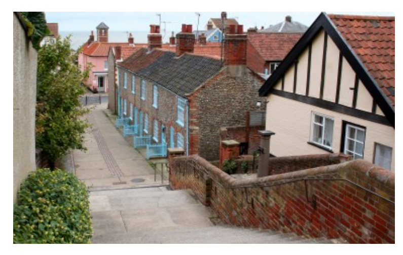
Blakeney: Red-brick, flint and cobblestone walls with pantiled roofs.

Here you'll still find slates as these were transported everywhere, then carry on up to Aldeburgh and the plaintiles are now entirely replaced by pantiles, plain-tiles to the south with pantiles to the north, the cut-off point really is that sharp. As far as I know there are only two locations south of there where pantiles do occur, one's at Sandwich and the other's at Tunbridge Wells, both are situated in Kent. From here on it's red-brick, flint and cobblestone walls with pantiles right up the coast to Blakeney and Wells-next-to-Sea.