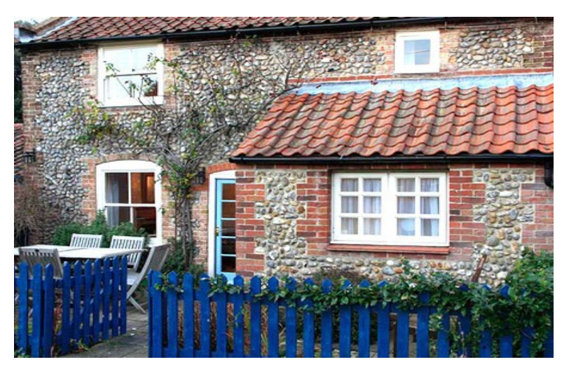
Blakney. A red-brick cobblestone building with a pantiled roof. The extension uses local materials to local designs and the overall work is reasonable enough. But despite this it really is very awkwardly placed and somewhat obtrusive, both the upper windows don't look good and the right-hand one is reduced to the size of a pea.