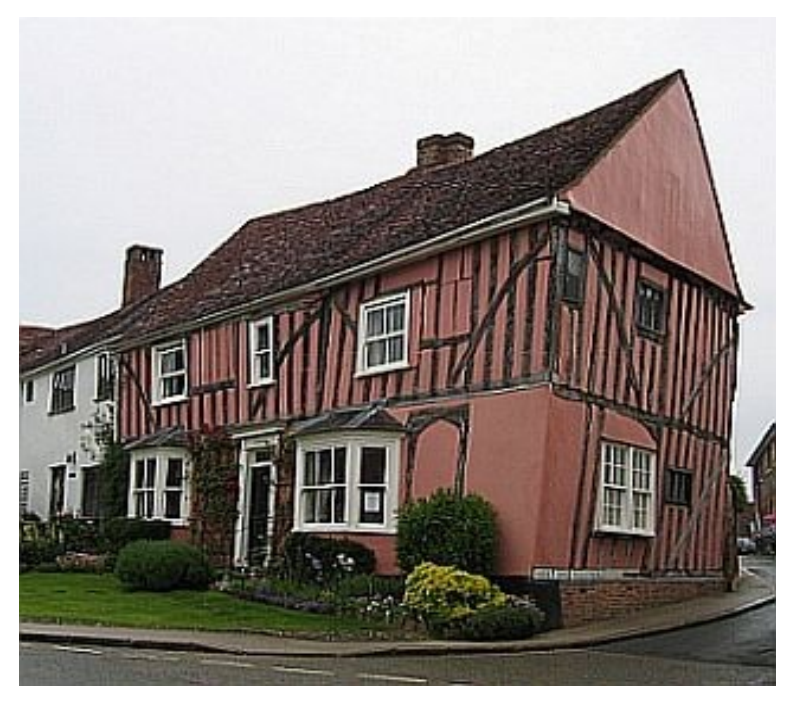
Lavenham: A timber-framed building with a plain-tiled roof painted in Suffolk-pink.

Starting out by the Thames, the buildings there are mainly of white-brick roofed with slate but travel up the coast a bit and the red-brick buildings with plain-tiles begin to make an appearance. As we continue we come across examples with lime-plastered walls pargetted with local patterns, then entering into Suffolk we see buildings painted pink, where this is locally known as Suffolk-pink. Historically pig's blood was added to give the colour but these days an iron oxide substitute mix is generally used.