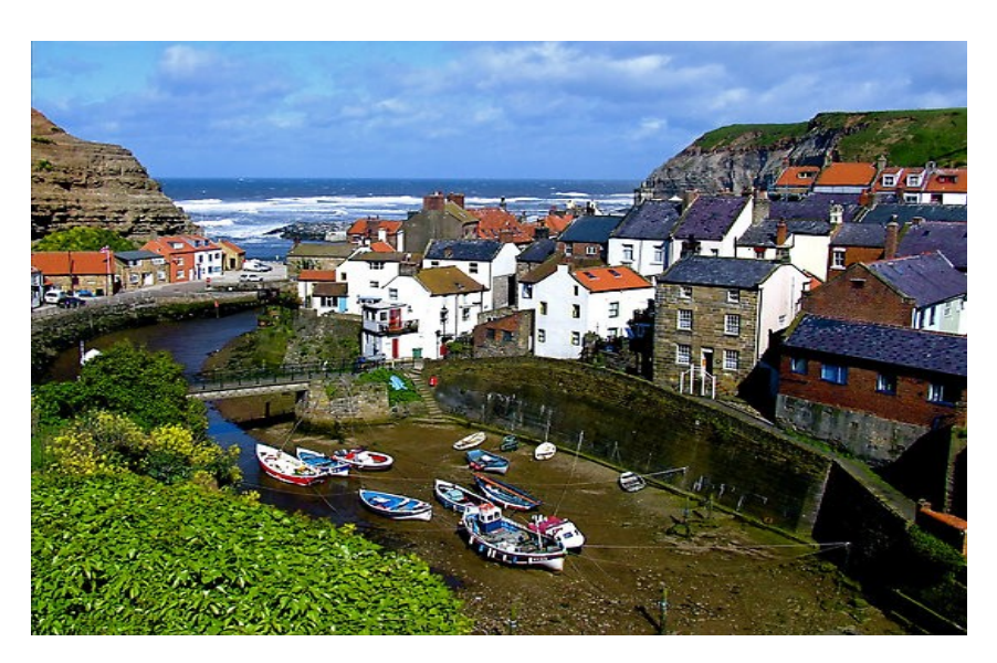
Staithes: Higgledy-piggledy houses delightfully nestling in the hillside. A mixture of limestone and red-brick roofed with slate and pantiles.

Travel all the way up past Lincolnshire and into Yorkshire, red-brick, limestone, pantiles but with slate roofs now becoming increasingly prominent as we continue. Inland from there at Richmond pantile and slate roofs give way to stone-slate.