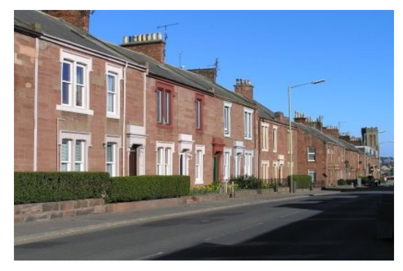
Arbroath: Local lime/sandstone, slate roofs with some pantiles.

New housing today could so easily be more inspiring than it is, reflecting these local differences and traditions, instead of eradicating it with the creeping cancer which is eroding regional identity wherever it is encountered. Forget about all of that mock-Tudor stuff everyone threw up in the past, for the most this not only had very little to do with tradition or good architecture, but was an outright insult to the craftsmen and architects of that period. In some places, there are albeit too few examples, in Norfolk for example, one or two locations in Yorkshire and elsewhere and some of the results can be very good. But they are unfortunately all too rare, and so often too we see builders doing their own thing, often to the detriment or out of character to these local traditions. We see them built in housing estate fashion instead of in rows, the materials may be wrong or incorrectly used, a lack of chimney-stacks is regular and common, the scale may not be right, windows of all shapes and sizes all over the place, the list just goes on.