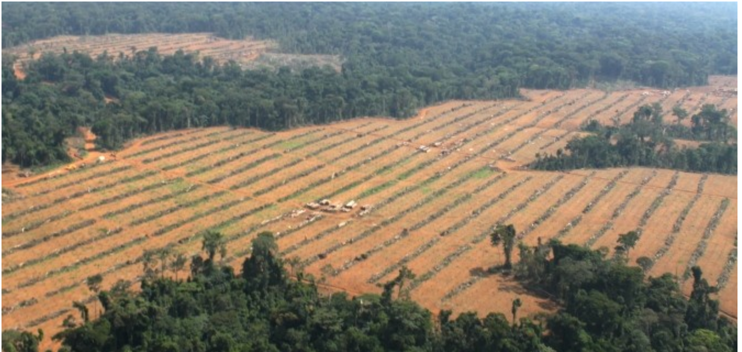
Recent picture of the palm oil plantage area

The endangered Chimpanzee stands to have swathes of its forest habitat in Cameroon destroyed if a US company's controversial plans to establish a palm oil plantation in the area are not stopped.