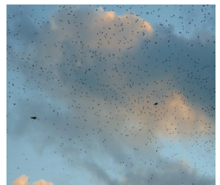
While finally, in Aberystwyth 2014-15, taken by ourselves four years later still.