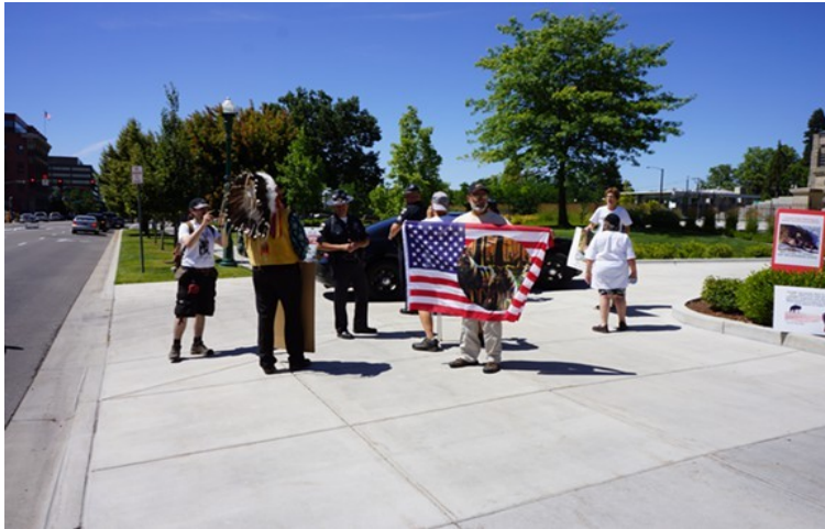
Meanwhile demonstrators protesting against Idaho's wolf policy and the Wolf Control Board.