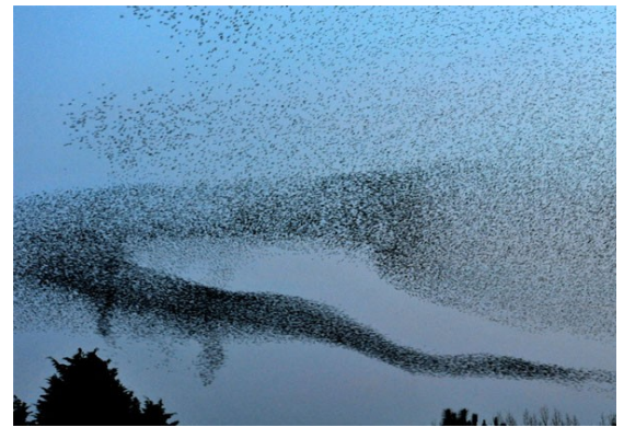
Starling flocks at unknown times and locations.

https://www.youtube.com/watch?v=CSNHaatMC4w