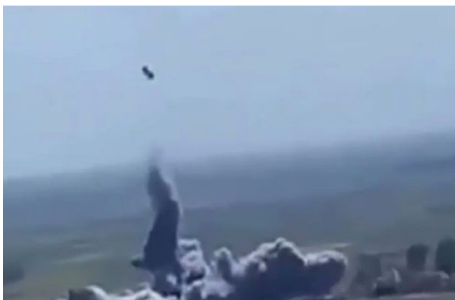
ISIS suicide bomber's car explodes after being hurled into mid-air by a roadside device.

Please send this link over to the badger killers on the next attachment.