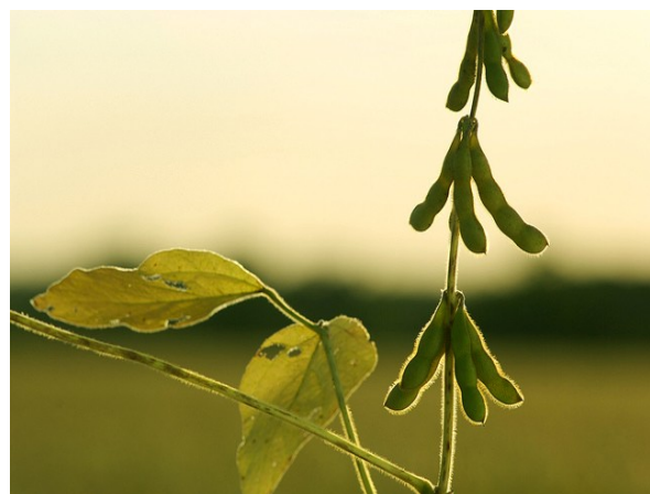
This is his kind of forestry along with soya which both of which are fast destroying the native forests.