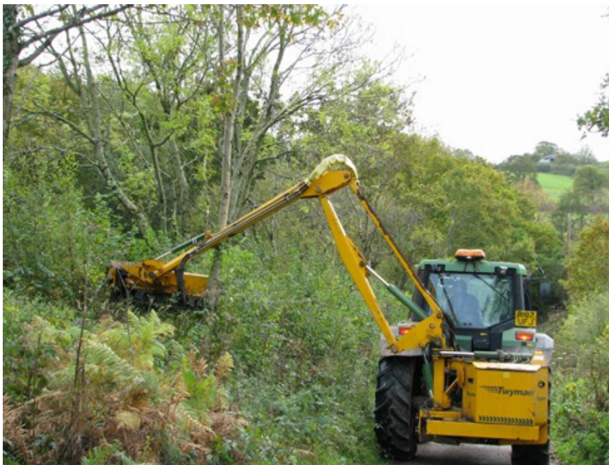
The Perverse and Widespread Practice of Hedge-Flailing

Each and every year, and for whatever reason, the hedge-flailers are out in force. Widely limiting any habitat potential, killing insects, destroying berries and wrecking trees. In terms of damage it is certainly up there with pesticides, grassland mismanagement, alien species and wind-farms and is a major reason as to why there's no wildlife in the countryside today.