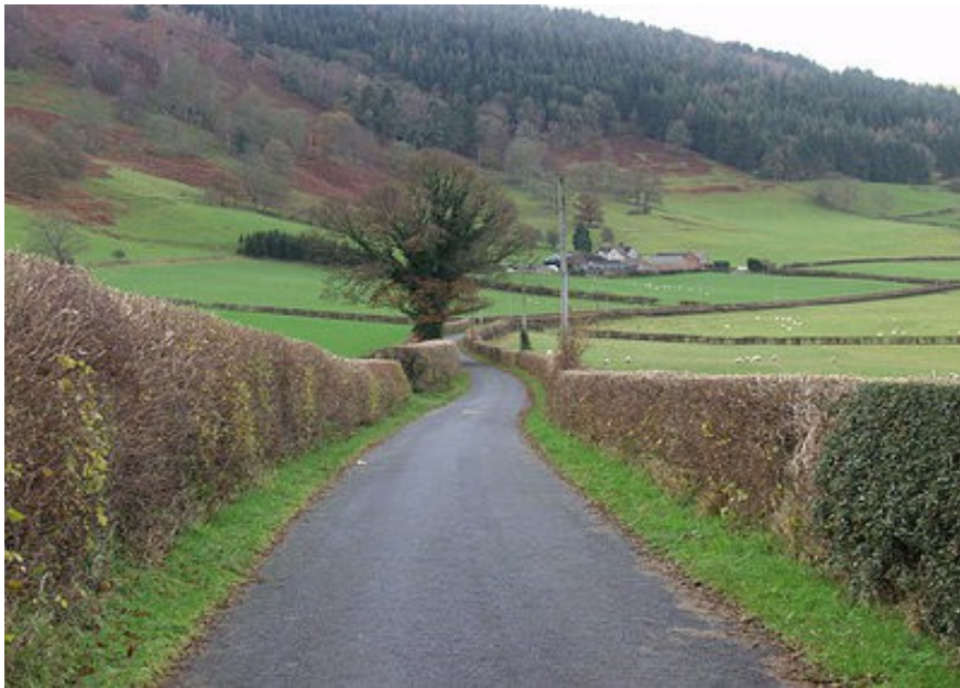
Neat and Tidy but an Ecological Void; no Insects, no Berries and no Cover