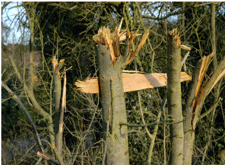
Close Up we can see just how Smashed to Pieces and Open to Disease some hedges become