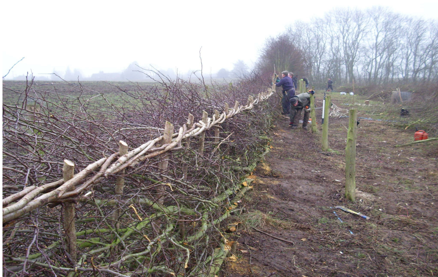
Traditional Hedge-Laying Complete with the all important Stock-Proof Fencing is a Practice everyone should encourage and support