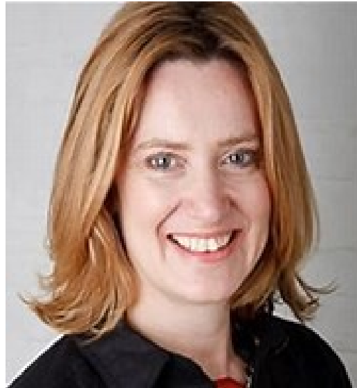
Amber Rudd, the Secretary of State for Energy and Climate Change

Dogger Bank: 400 extra Turbines Right in the Middle of their Migration Route.