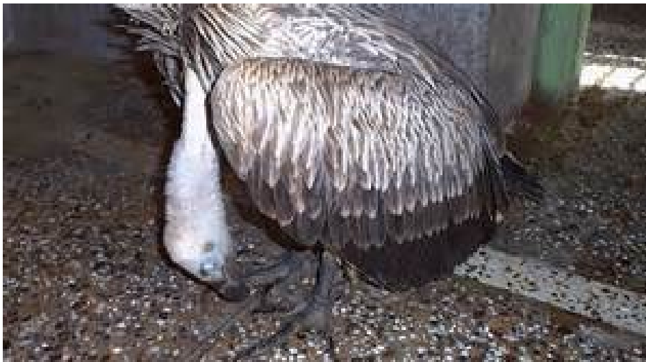
The Tell-Tale Signs Of Diclofenac Poisoning, The Head Hanging From Its Drooping Neck, A Magnificent Bird Reduced To This Pitiful State

Thanks to lobbying from them, diclofenac is now in widespread use as a veterinary drug throughout the EU., knowingly endangering its Southern European Vulture populations. This company still continues with its TV. ads. so please write to them even though you may've done so several times before.