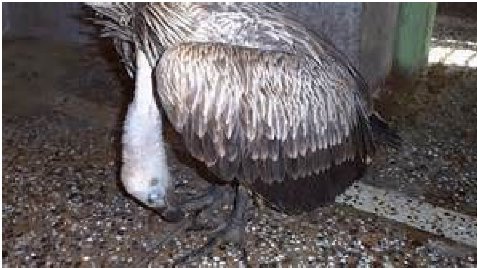
The Tell-Tale Signs Of Diclofenac Poisoning, The Head Hanging From Its Drooping Neck, A Magnificent Bird Reduced To This Pitiful State

Thanks to lobbying from them, diclofenac is now in widespread use as a veterinary drug throughout the EU., knowingly endangering its Southern European Vulture populations. This company still continues with its TV. ads. so please write to them even though you may've done so several times before.