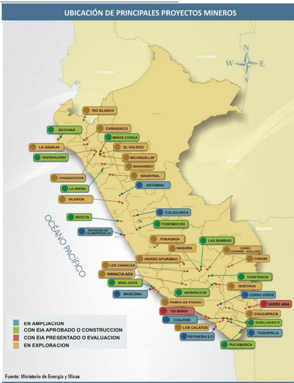
Photo I. Shows the location of the main locations of mining projects.

Mining concessions have grown from 2.26 million - to 2.26 Has between 1991 and 1997 – and up to 26 million has in 2012. 5 At the same time, socio-environmental conflicts have become the most important type of social conflicts in Peru. About 2/3 of public registered conflicts pertain to this category. The two most conflictive regions are Ancash and Apurimac, due to the mighty expansion of mining ventures in these departments. 6